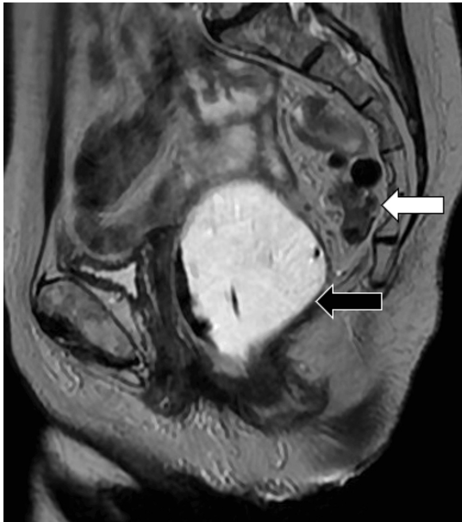
FIGURE 1: Sagittal T2-weighted image of the pelvis showing the sigmoid colon (white arrow) in the presacral space – posterior to the rectum (black arrow) during the rest phase of MR defecography. The rectum is distended with T2 hyperintense gel per MR defecography protocol.