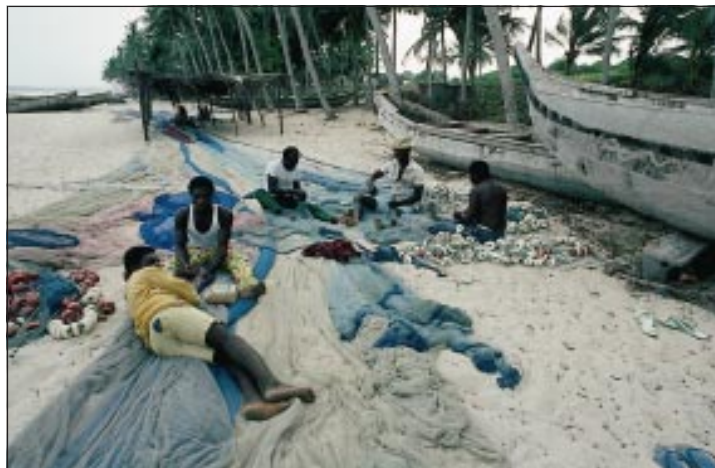
Although the relative risk of a cardiovascular event in people with high and normal blood pressure is similar in Africa and the United States, the absolute risk is up to 13 times greater in Africans

Sub-Saharan Africa is a diverse region comprising 47 countries. It is home to approximately 480 million people. 6 Among the elite in African society, the model for hypertension control currently in force in Europe and the United States would be entirely appropriate. However, most Africans (fully 75%) live in rural areas