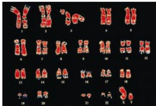
Understanding of how genes might modify our susceptibility to disease is evolving

One of the earliest applications of this genetic information will be in the discovery and development of new drugs. Genetics is now widely used to identify new targets for drug designs, and it is increasingly recognised that defining disease populations by genotype will probably correlate with response to drug treatment. The variety of mechanisms that underlie complex disease may account for the wide variations in response seen in clinical practice and the difficulty often encountered in