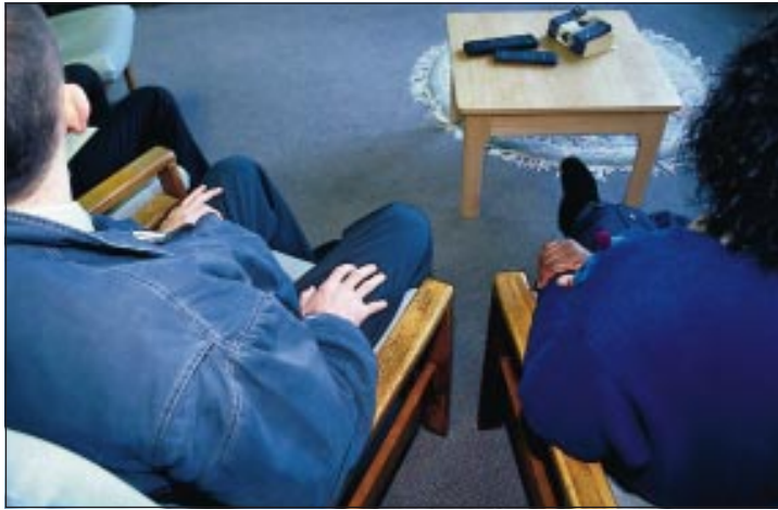
Is it the cognitive-behavioural component of the therapy that works, or is non-specific group support more important?

observational studies may be the only way of assessing an intervention, and some of these have undoubtedly been useful. To accept the randomised controlled trial as the best way of gauging efficacy is not necessarily to dismiss other study designs that have the same objective. 17 8 For example, no randomised controlled trial of the efficacy of condoms in preventing sexual transmission of HIV has been carried out. Given the seriousness of HIV disease and the consistency of early, albeit inconclusive, studies supporting condom use, such a trial would have been unethical. However, in a well designed prospective study of sexual partners whose HIV status differed, the seroconversion rate was zero between couples who used condoms consistently and about 5% per year in those who did not. 9 Given this evidence of condom efficacy, we can be more confident that the decrease in the rates of sexually transmitted diseases and HIV infection in Thailand is due to the effectiveness of a nationwide campaign that dramatically increased condom use in brothels. 10