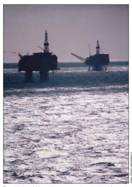
The original model for accident assessment was developed for use in complex industrial settings such as offshore drilling platforms

In spite of increased attention to quality, errors and adverse outcomes are still frequent in clinical practice.<sup>1</sup> The risk of iatrogenic injury to patients in acute hospitals remains high, with studies reporting rates of