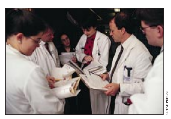
Training can reduce adverse events

Each staff member is part of a team, both within their unit and in the wider organisation of the hospital or community unit. The way individuals practise and their impact on the patient are constrained and influenced by other members of the team and the way the team members communicate with, support, and supervise each other. The team is affected in turn by management actions and by decisions made at a higher level in the organisation. The team's environment is partly control-