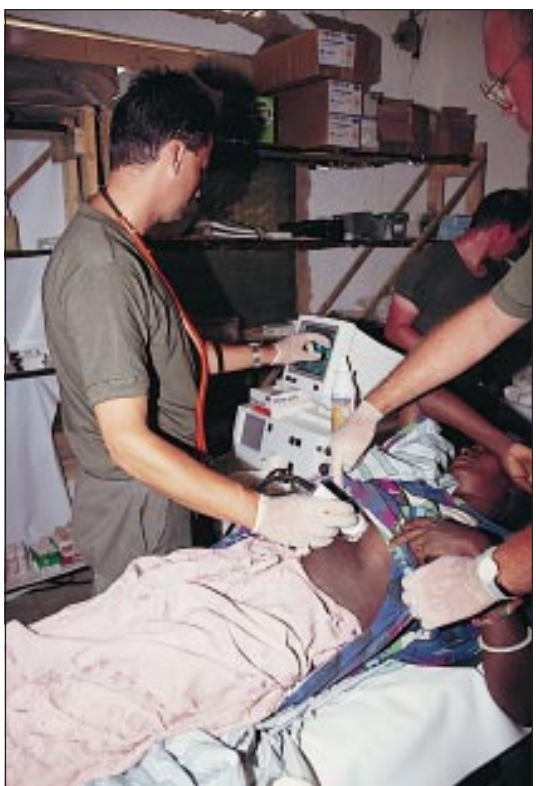
Nosocomial transmission of HIV is often a worry for health professionals seeking work experience in Third World countries

prevalence area, and a seroconversion risk of three per 1000, one in every 333 health workers would be expected to acquire HIV infection each year through their work.