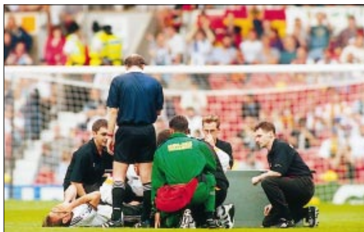
Should a doctor who has been drinking alcohol offer assistance when the official doctor is not available?