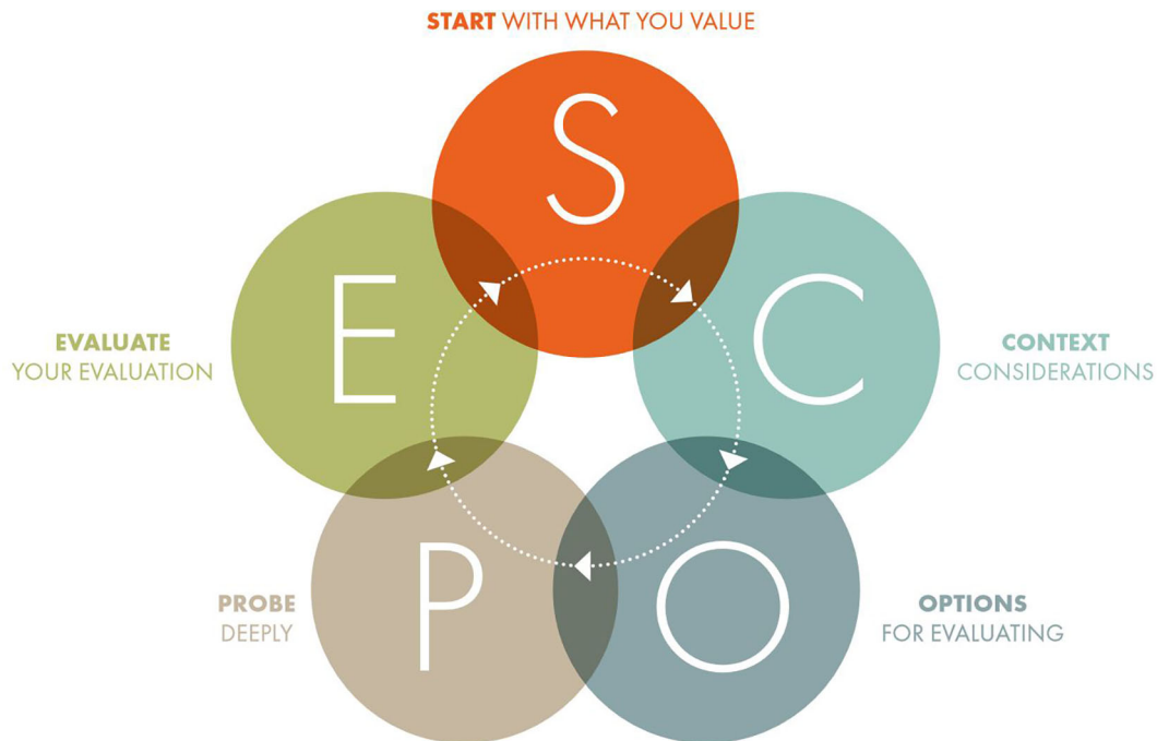
Figure 1. The SCOPE Framework (from The SCOPE Framework: a five-stage process for evaluating responsibly: https://doi.org/10.26188/21919527.v1 ).

The five stages of SCOPE presented in Figure 1 operate under three main principles. The first is to evaluate only where necessary. Hallonsten argues that science has been enormously productive even in times when quantitative performance