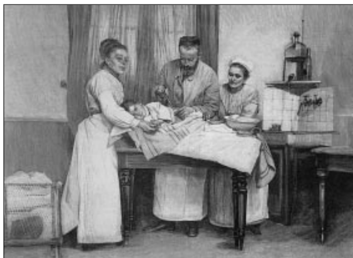
Serum treatment for diphtheria, 1894

Internationally, randomisation was mentioned by van Helmont in 1662. 18 He suggested the casting of lots to decide which patients with fever should be assigned to blood letting and which should not. Randomisation was not used in clinical experiments, however, before 1898. 19 In 1884 Peirce used a deck of cards to determine the order of weight changes in an investigation of the threshold for perception for small differences in weights. 20 Peirce's innovation was not appreciated, and he is mostly remembered as one of the founders of the philosophical movement called pragmatism. Some months later, the French Nobel laureate Richet published a series of trials that investigated whether thoughts could be transferred from one subject to another. 21 After a person had drawn a card from a deck