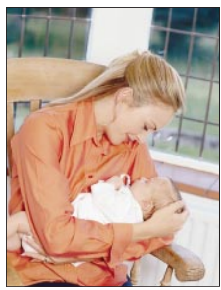
As a woman takes on the roles of mother and housewife, the importance of the lover role may diminich

Possible sources for sexual learning include parental values, religious teaching, cultural mores, and life events