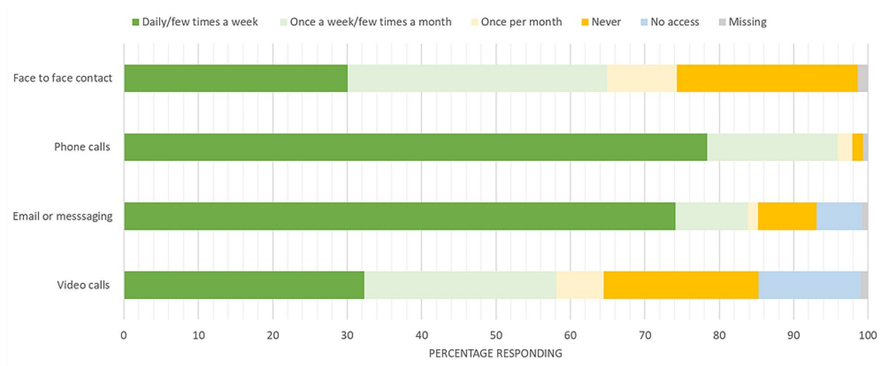
Fig. 2 Type and frequency of contact with people outside of participants' homes (n = 3856)