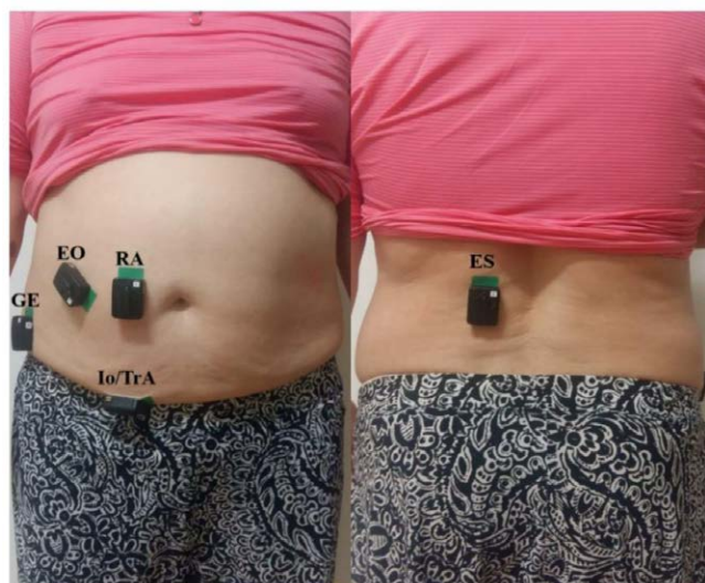
Figure 3. EMG electrodes on abdominal muscles and the erector spine. EO = external oblique; ES = erector spinae muscle; GE, ground electrode, Io/TrA = internal oblique and transversus abdominis, RA = rectus abdominis.

the electrode was positioned 1 to 2 cm medial and below the anterior superior iliac spine (ASIS). [29] The electrode was placed parallel to and approximately 3 cm lateral to the L3 spinous process to measure ES. [30] The ground electrode was then placed on the ASIS.