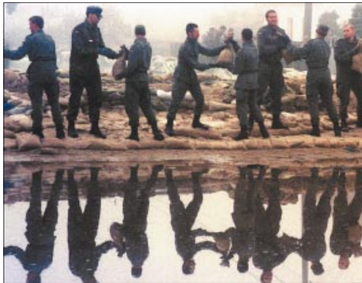
Fig 3 Floods in central Europe in 1997

flies, cockroaches, and rodents) may change in response to climatic changes.