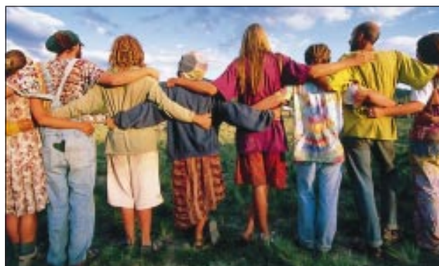
Stereotypes about use of complementary medicine being associated with alternative lifestyles are not supported by the research evidence