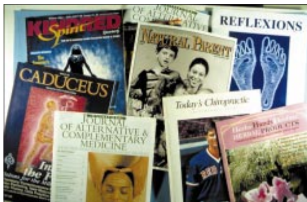
Numbers of specialist publications for complementary medicine are growing