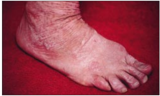
Patients are more likely to turn to complementary medicine if they have chronic, relapsing and remitting conditions such as eczema

Less is known about access via secondary care, but certain specialties are more likely to provide complementary therapies. In 1998 a survey of hospices revealed that over 90% offered some complementary therapy to patients. Pain clinics, oncology units, and rehabilitation wards also often provide complementary therapies.