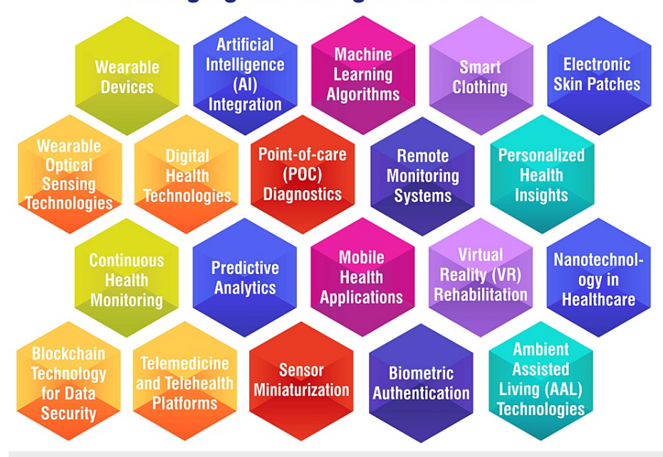
FIGURE 2: Emerging technologies and trends

The image is created by the corresponding author