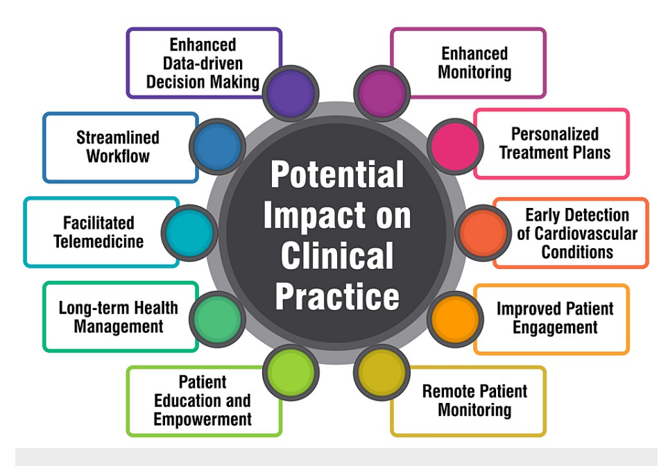
FIGURE 3: Potential impact on clinical practice