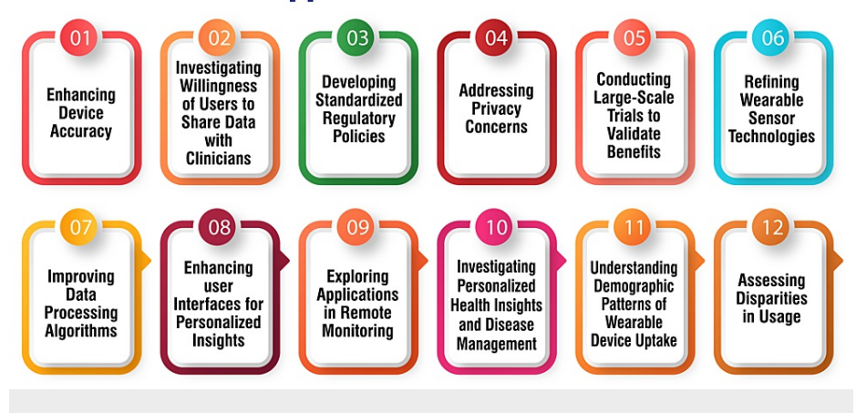
FIGURE 4: Research opportunities and collaborations