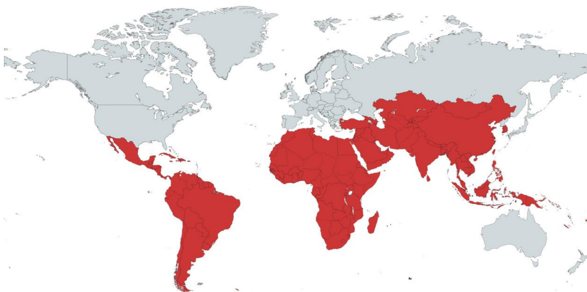
Figure 1 This map displays in red the LMICs that were eligible for inclusion in this study based on the United Nations classification by income and development. 15 LMICs, low-income and middle-income countries.

assessed for similarities and differences between studies in each thematic area.