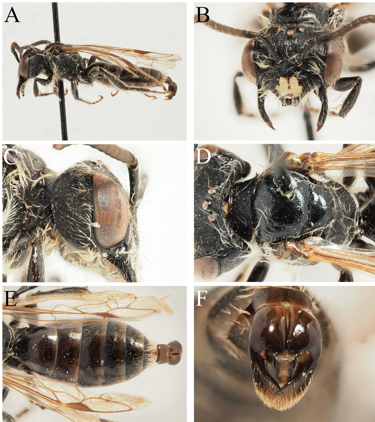
Figure 3. Andrena (Notandrena) ayna Wood, 2023 male A habitus, lateral view B face, frontal view C head, lateral view D scutum, dorsal view E terga, dorsal view F genital capsule, dorsal view.

scape. Antennae basally dark, A4–13 ventrally lightened by presence of greyish-brown scales; A3 exceeding A4, shorter than A4+5.