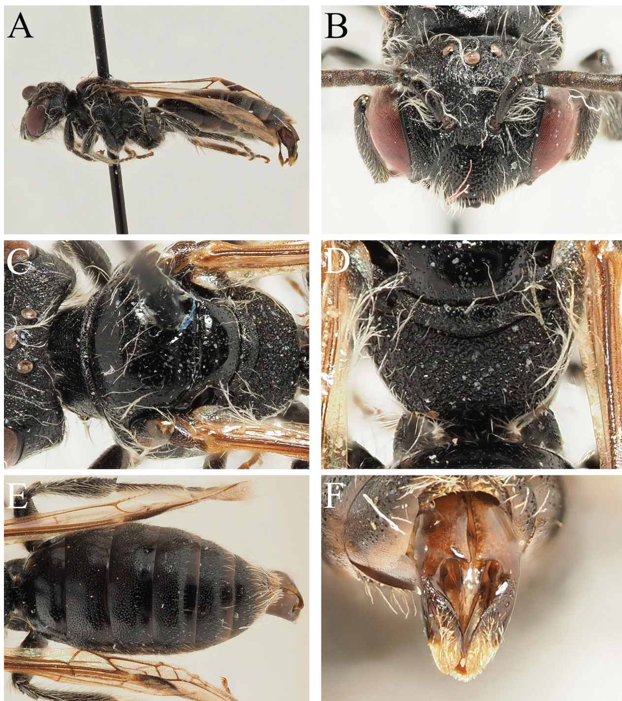
Figure 7. Andrena (Micrandrena) obsidiana Wood, 2022 male A habitus, lateral view B face, frontal view C scutum, dorsal view D propodeum, dorsal view E terga, dorsal view F genital capsule, dorsal view.

capsule somewhat elongate, gonocoxae with apical margins produced into slightly projecting narrow apical teeth (Fig. 7F). Gonostyli robust, thickened, with weak and obscure bump on internal margins basally, apical \frac{1}{2} lightened hyaline yellowish. Penis valves narrow, occupying \frac{1}{2} space between gonostyli, uniformly narrowing towards apex.