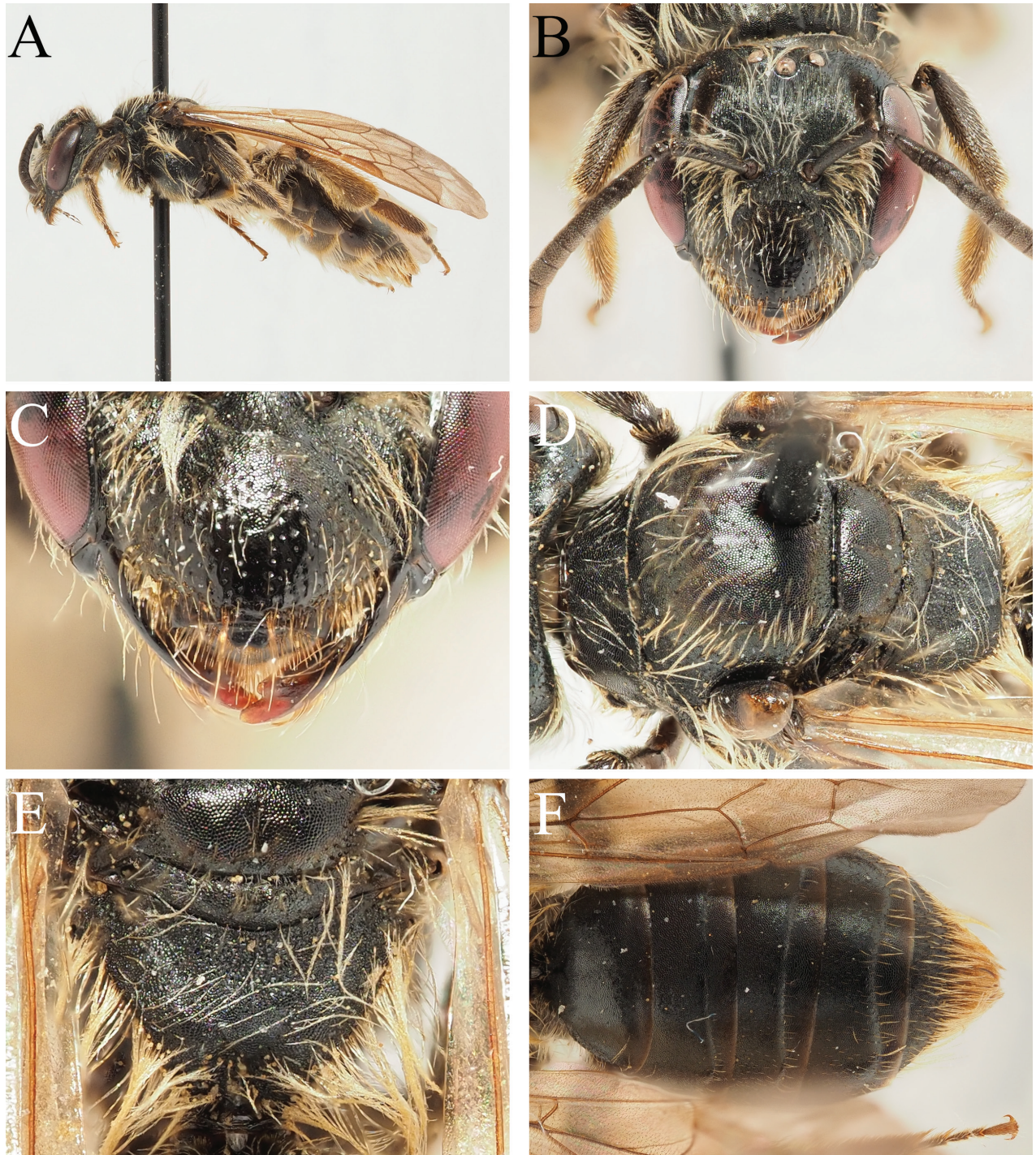
Figure 4. Andrena (Notandrena) baiocchii sp. nov. female A habitus, lateral view B face, frontal view C clypeus, frontal view detail D scutum, dorsal view E propodeum, dorsal view F terga, dorsal view.

punctures becoming sparse, in the apical 1/3 of the clypeus with punctures separated by 1–3 puncture diameters (Fig. 4C). In comparison species the clypeus usually has a uniform sculpture, typically dull, never smooth and shining in its apical half (with the exception of A. trimarginata ) and the clypeal punctures are consistently denser. Andrena trimarginata can be separated by the overall shape of the head (clearly wider than long) and by the density of clypeal punctures which are separated by a consistent 0.5–1 puncture diameters over the entire surface of the clypeus. Some individual species can also be separated