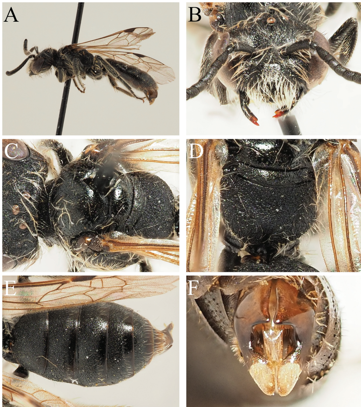
Figure 6. Andrena (Micrandrena) elam Wood, 2022 male A habitus, lateral view B face, frontal view C scutum, dorsal view D propodeum, dorsal view E terga, dorsal view F genital capsule, dorsal view.

Distribution. Morocco, Algeria, Tunisia, Libya, Egypt, Israel and West Bank, Jordan, Syria, Iraq, Iran (Gusenleitner and Schwarz 2002; Wood and Monfared 2022).