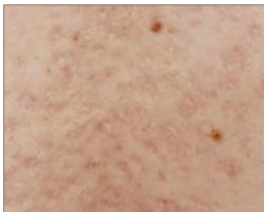
Fig 3 Atrophic scars after acne in upper back and shoulder area of a white man

Atrophic scars are flat and depressed below the surrounding skin. They are generally small and often round with an indented or inverted centre (fig 3), and commonly arise after acne or chickenpox. 13