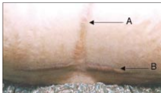
Fig 2 Widespread scar (A) in the midline after surgical incision and a hypertrophic scar (B) after transverse surgical incision in an Asian woman

Widespread (stretched) scars appear when the fine lines of surgical scars gradually become stretched and widened, (fig 2) which usually happens in the three weeks after surgery. 9 They are typically flat, pale, soft, symptomless scars often seen after knee or shoulder surgery. 12 Stretch marks (abdominal striae) after pregnancy are variants of widespread scars in which there has been injury to the dermis and subcutaneous tissues but the epidermis is unbreached. There is no elevation, thickening, or nodularity in mature widespread scars, which distinguishes them from hypertrophic scars.