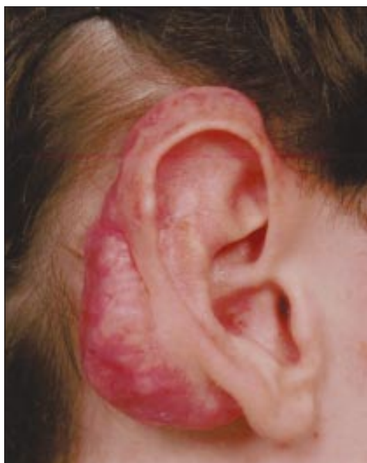
Fig 6 Right ear keloid scar after reduction surgery for prominent ears in a white man

Keloid scars are raised scars that spread beyond the margins of the original wound and invade the surrounding normal skin in a way that is site specific. Ear lobe keloids often grow as large lobules (fig 6), central sternal keloids commonly develop a butterfly shape, and deltoid keloids tend to extend vertically. A keloid continues to grow over time, does not regress spontaneously, and almost invariably recurs after simple excision. It is difficult to apply the term keloid until a scar has been present for at least a year, although there is no precise