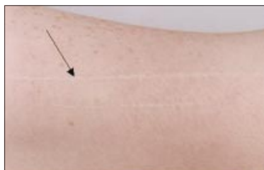
Fig 1 A fine line scar in forearm of a white man after a knife wound

Skin tissue repair results in a broad spectrum of scar types, ranging from a “normal” fine line (fig 1) to a variety of abnormal scars, including widespread scars, atrophic scars, scar contractures, hypertrophic scars, and keloid scars.