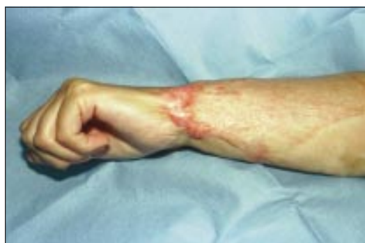
Fig 4 Scar contracture of forearm and wrist after a burn injury to a white woman

Scar contractures —Scars that cross joints or skin creases at right angles are prone to develop shortening or contracture. Scar contractures occur when the scar is not fully matured, often tend to be hypertrophic, and are typically disabling and dysfunctional (fig 4). They are common after burn injury across joints or skin concavities.