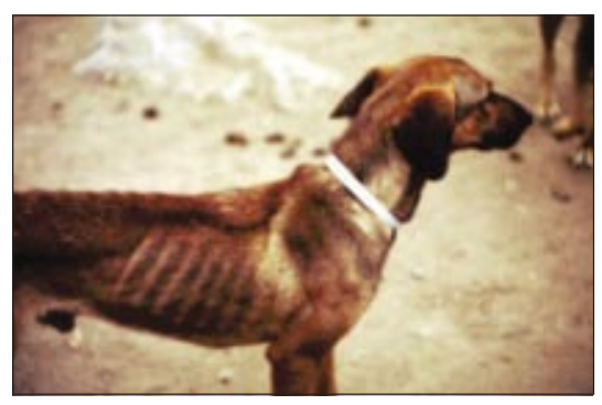
Fig 4 This deltamethrin treated collar (Scalibor, InterVet, Boxmeer, Netherlands) provides dogs (the reservoir host of L infantum ) with long term protection against sandfly bites and canine visceral leishmaniasis. Field trials in Iran show that providing all dogs in a community with collars also protects children against L infantum infection

This result cannot be extrapolated elsewhere, as effectiveness of insecticide treated bed nets is determined by local sandfly behaviour. It is unclear, for example, whether the provision of about 300 000 such nets by Médecins Sans Frontières in eastern Sudan during 1998-2001 substantially reduced the incidence of visceral leishmaniasis (R Davidson personal communication). To our knowledge, insecticide treated nets have not been introduced outside the Sudan by any leishmaniasis control programme (as opposed to a trial) except in Afghanistan and Pakistan, where they have been provided by HealthNet to patients with active cutaneous lesions (L tropica). Their aim is not to protect the patients but to block transmission, as L tropica is transmitted anthroponotically. As with house spraying, it is unclear whether the widespread use of insecticide treated nets will have any mass effect, as