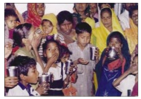
Fig 3 Children taking miltefosine, the first oral drug for visceral leishmaniasis, which was registered in India in March 2002. Trials indicate that this drug is highly effective, even against antimony resistant cases

Oral drugs have also shown promise. In an open label study in Colombia four weeks' treatment with