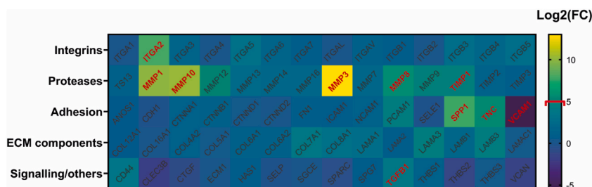
Fig. 1. Screening of extracellular and cell surface genes expressed by DP-MSCs in fibrin hydrogel. Extracellular and cell surface genes differentially expressed after 1 day were screened using a PCR array. Results were represented by a heatmap where each box's color is proportional to its fold change value in the logarithm base of two (scale at the right). The genes in both red and bold are the top 10 most significantly up-regulated. Corrected t -test was performed for this analysis. P values < 0.005 for red-colored genes.

Four MMPs molecules were selected because of their very high fold change and their relevance in our study: MMP1, MMP3, MMP10, and MMP12. The majority of compounds with active regulation were found in this category. MMP3 stands out from the other genes with a fold change of 13.02, indicating a strong increase during the first day of culture. It was accordingly selected to be further studied at protein level.