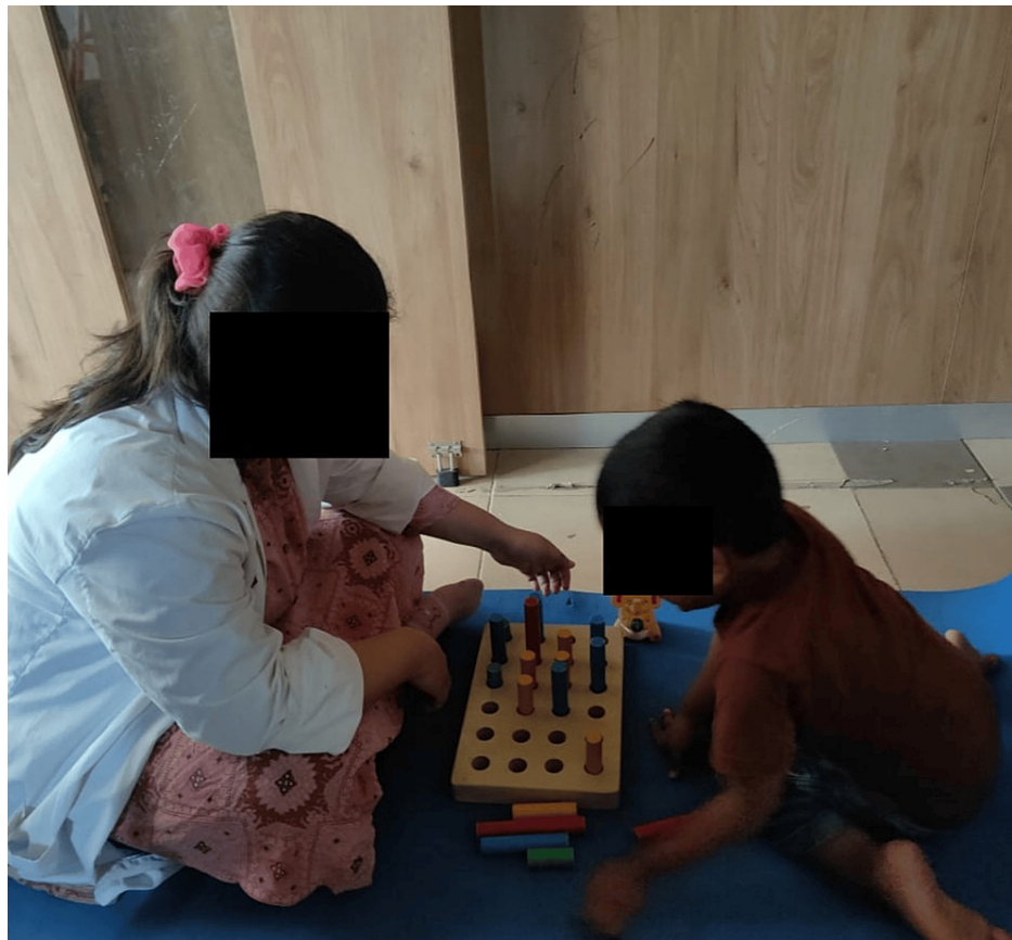
FIGURE 2: Pegboard activity in a dimly lit room.

Incorporating treadmill exercises into the routines of children with ADHD can be highly beneficial for managing symptoms and enhancing overall well-being. Physical activity, such as walking or running on a treadmill, has been shown to improve focus, reduce hyperactivity, and enhance mood by increasing the levels of neurotransmitters such as dopamine and norepinephrine in the brain. Structured treadmill sessions provide a controlled environment for children to expend excess energy, helping to mitigate restlessness and impulsivity. Additionally, regular aerobic exercise can enhance cognitive function, support better sleep patterns, and contribute to overall physical health, making it a valuable component of a comprehensive ADHD management plan (Figure 3).