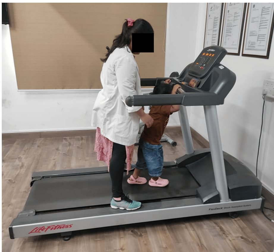
FIGURE 3: Treadmill walking.

Clay therapy (Figure 4), also known as clay art therapy, is a form of expressive therapy that involves the use of clay as a medium for emotional expression and psychological healing. This tactile and hands-on approach allows individuals to mold, shape, and create objects, facilitating a connection between their inner experiences and external creations. The act of working with clay can be calming and grounding, helping to reduce anxiety and stress. For children, it enhances fine motor skills, encourages creativity, and provides a non-verbal outlet for emotions that might be difficult to articulate. For adults, clay therapy can uncover subconscious thoughts and feelings, promote self-discovery, and aid in processing traumatic experiences. Overall, clay therapy offers a unique and effective way to explore and heal emotional issues through artistic expression and sensory engagement.