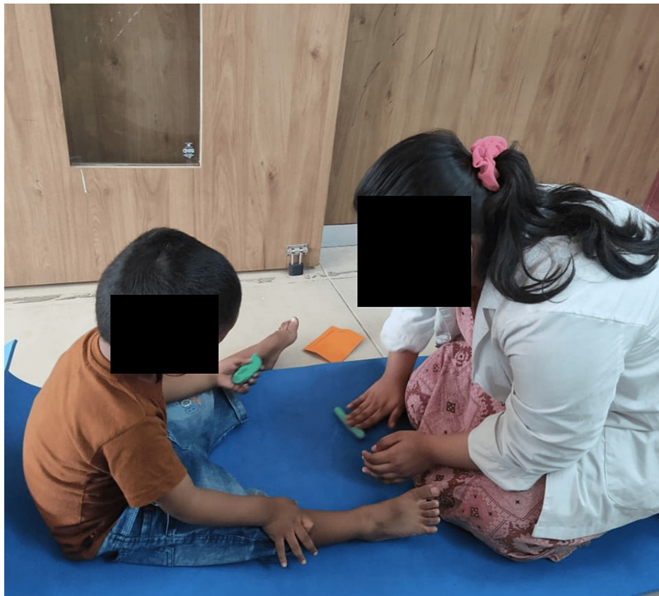
FIGURE 4: Clay therapy.

Pre-physiotherapy, the child struggled with eye contact, social interaction, attention, speech, communication, emotional expression, play behavior, and obeying commands. Post-intervention, notable improvements were seen across all areas, with the child now confidently engaging with others, maintaining focus, communicating effectively, regulating emotions, and demonstrating age-appropriate play and obedience. A detailed summary is presented in Table 8.