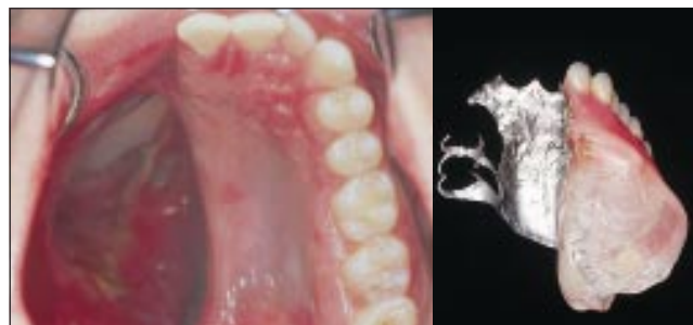
Patient with palatal defect (left) and obturator made to separate oral and nasal cavities (right)