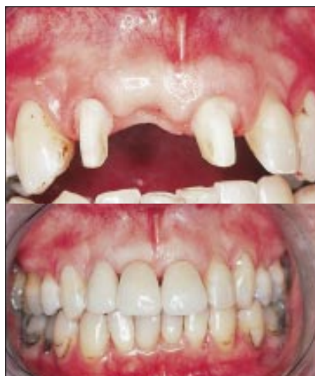
Conventional bridgework in patient with missing incisor: neighbouring teeth are ground down to take artificial crowns (top) and final result (bottom)