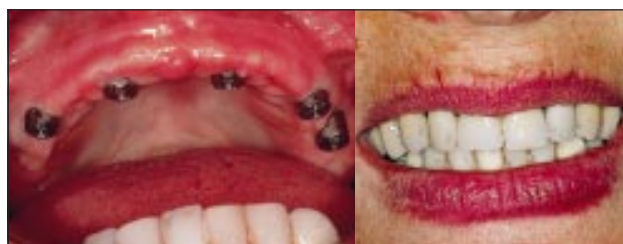
Patient with implants inserted surgically into alveolar bone of edentulous maxilla (left) to stabilise fixed bridge (right)