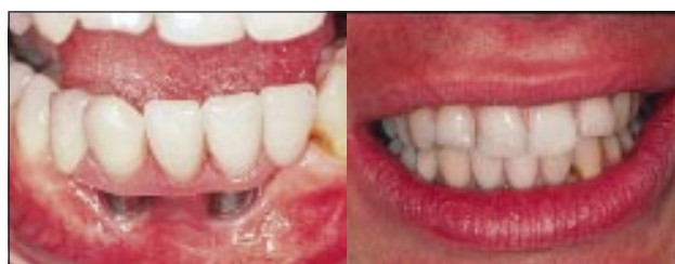
Patient with missing teeth and jaw bone after road traffic accident: temporary appliance on dental implants (left) and definitive prosthesis in place (right)