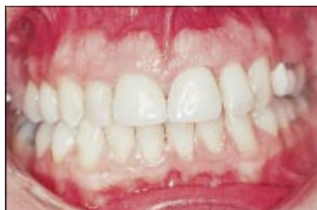
Conventional crown on maxillary left central incisor