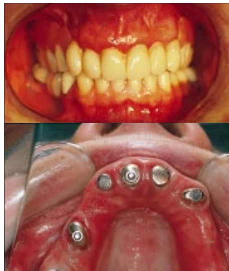
Overdenture (top) supported by metal studs inserted into natural tooth roots (bottom)