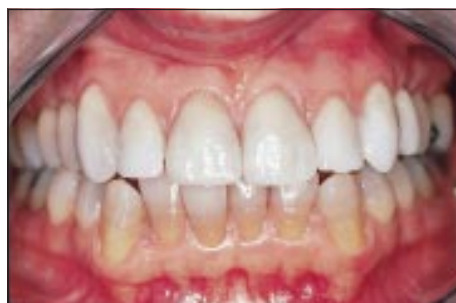
Porcelain veneers to treat tetracycline staining of upper teeth (appearance of lower teeth was deemed acceptable)