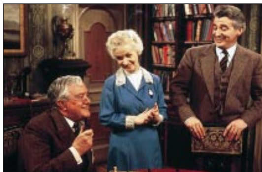
Dr Finlay's Casebook: the traditional view of personal continuity

Most research about the impact of continuity of care has been conducted in antenatal care or in specialist care settings in the United States. 6-10 Generalising these results to general practice in the United Kingdom is possible but problematic. Research shows that a patient's enablement and satisfaction with a consultation is strongly associated with visiting the same doctor. 11-13 Patient satisfaction is also higher in practices that are small, non-training, or have personal lists. 13-14 Smaller studies in the United Kingdom have had more inconsistent results, some showing no effect on quality of care and others showing that when doctors know patients well, compliance and the accuracy of diagnosis are increased. 15-17