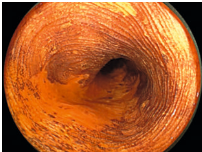
► Fig. 1 Semiperipheral superficial esophageal cancer in the upper thoracic esophagus.