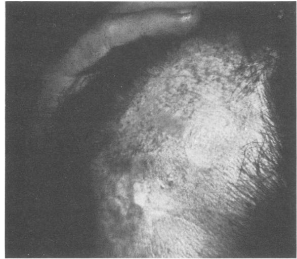
Figure 2.—Complete obliteration of majority of port-wine stain with no scarring.

years, and with telangiectasia, 35 years. There were very few associated diseases in any of the patients. Only the patients with varicose veins showed a family history correlated to the mother. It should be emphasized that the varicose vein group included those superficial varicosities that were found on the skin surface and were not the common greater and lesser saphenous varicose veins that are connected to the deep system. No patient had significant cardiorespiratory disease, was taking continuing medications or had significant allergies. The laser treatment power and dosage were correlated for each category and, remarkably, almost every category received ap-