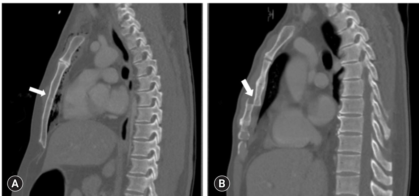
Fig. 2. Degree of displacement in sternal fractures. The degree of the fracture was classified as follows. (A) If the fracture encompassed 0% to 9% of the sternal width, it was defined as nondisplaced (indicated by the arrow, which points to the fracture line). (B) If the fracture encompassed 100% or more of the sternal width, it was defined as displaced (indicated by the arrow, pointing to the fracture line).

lateral radiography of the sternum was conducted. If sternal lateral radiography was not available, chest CT was performed instead.