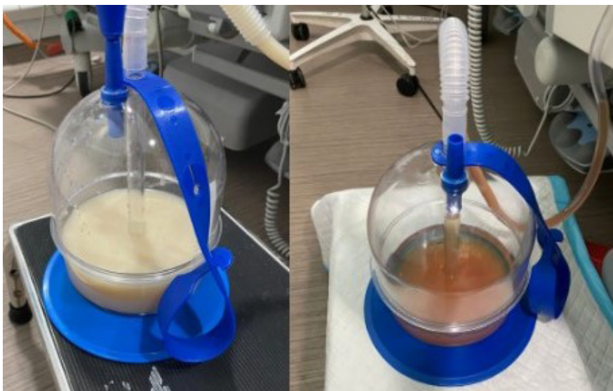
Figure 4. Drainage fluid initially (on left) and after treatment (on right).

These clinical findings would lead to the next step in the diagnostic pathway, which is the biochemical analysis of the pleural fluid. This is performed by retrieving fluid via thoracocentesis or via a previously placed chest tube. Routine imaging modalities (X-rays and CT scans) provide clues to the presence and volume of an effusion. On the contrary, dynamic contrast-enhanced MRL accurately identifies lymphatic anatomy and the source of chyle leak. The mainstay of therapy is conservative or surgical intervention. More recently, thoracic duct embolization via interventional radiology has gained popularity [1] .