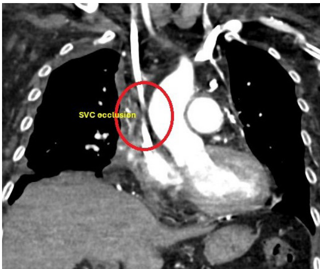
Figure 3. CT scan demonstrating SVC occlusion. Abbreviation: SVC, superior vena cava.

5 mg three times daily and octreotide 0.5 ml three times daily were initiated. The following day, after starting midodrine and octreotide, the patient's chest tube drainage was serosanguineous, and there was a significant reduction in chest drain output. The patient received a low fat and high protein diet. Over a week, the patient improved with no output from the drain, and the chest tube was removed. Follow-up X-ray showed no effusion.