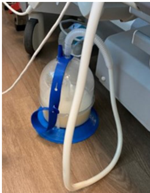
Figure 2. Chest drain with milky fluid.

taken to the operating room for pelvic fixation. However, after induction, he was desaturated, with high ventilatory pressures, and hypotensive. A central internal jugular central venous catheter was placed. A bedside ultrasound of the chest demonstrated a large right-sided effusion, and a right-sided chest tube was placed, which brought a whitish discharge of nearly 1 l (Fig. 2).