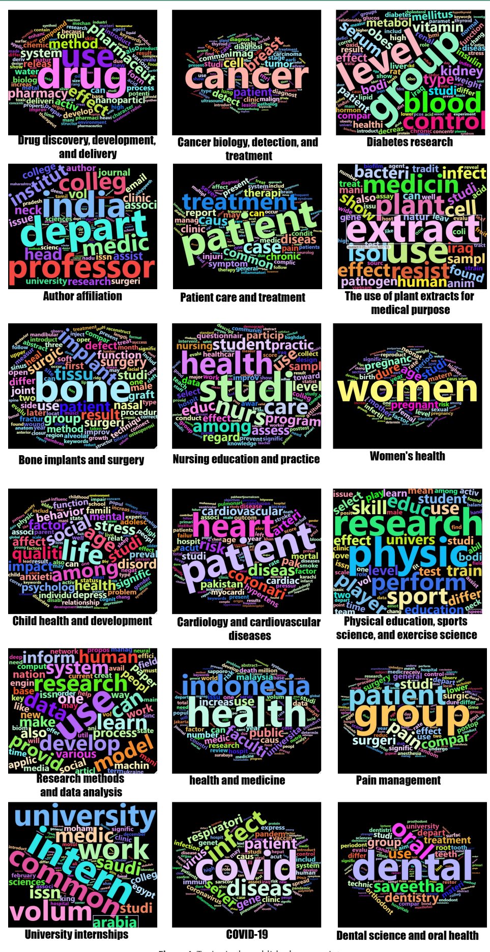
Figure 4. Topics in the published manuscripts