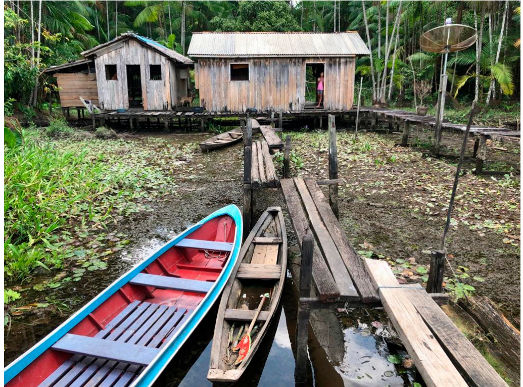
Figure 2. Typical riverine population dwelling distributed along the banks of the rivers of the Amazon Basin. Portel, 2019.

(Figure 2). As riverine communities are located on the banks of rivers, their dwellings can only be accessed by fluvial transportation, as there are no roads connecting the dwellings across the Amazon jungle. Humans and domestic animals provide a stable feeding source for the common vampire bat [16], leading to an increase in bat–human interactions and the eventual cases of rabies in these environments (Figure 3).