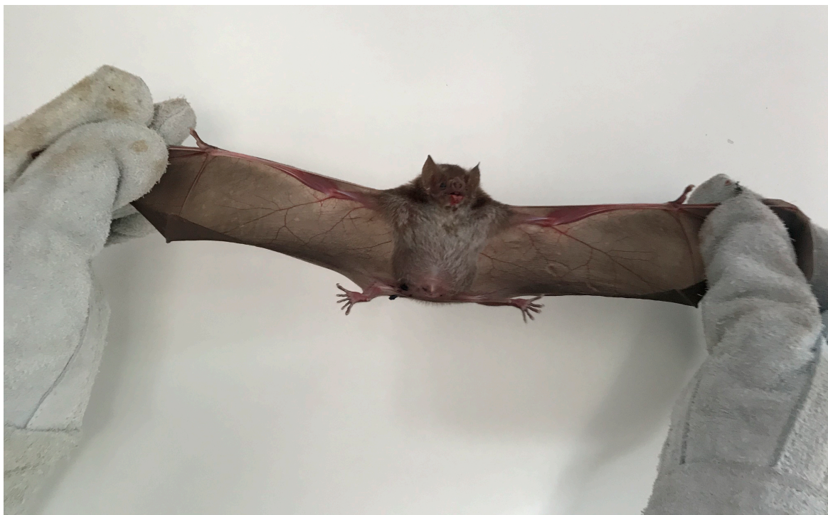
Figure 1. Desmodus rotundus bat captured in the proximity of a dwelling in the Pacajá River in Portel, State of Pará, Brazil. Portel, 2019.

Rabies is an acute zoonotic disease that affects the nervous system and continues to be a major public health concern. While canine rabies is still responsible for 99% of human rabies cases worldwide [1], effective actions and public policies have led to a significant decrease in cases of human rabies mediated by dogs in the Americas [2,3]. As a result of the significant reduction in human rabies mediated by dogs, human rabies through sylvatic cycle has become increasingly apparent, leading to a change in the disease's epidemiological profile. Rabies mediated by the Desmodus rotundus bat—the common vampire bat (Figure 1)—has emerged as a significant public health issue [4]. D. rotundus is one of the three species of hematophagous bats found only in the Americas [5] and the most abundant and prolific of these species. When feeding, it bites the mammal's body and licks the blood that flows from the wound on the skin, thereby transmitting rabies since the disease is mainly spread through saliva [6].