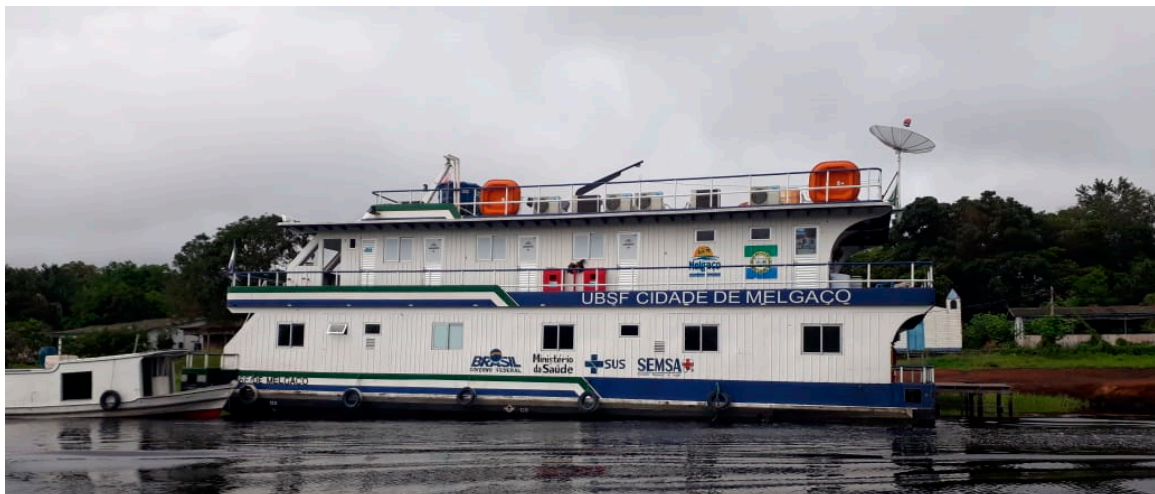
Figure 5. Photo of the Fluvial Basic Unit of Health. Portel, 2019.

The epidemiological survey gathered information about both individuals and residence characteristics. Individual characteristics included (i) sex, (ii) age (categorized as child—up to 10 years; adolescent—11 to 17; young adult—18 to 30; adult—31 to 60; and elderly—over 60), and (iii) history of bites by hematophagous bats (variable of interest). Residence characteristics comprised (i) presence of domestic animals in the residence; (ii) history of bites by hematophagous bats in animals; (iii) use of lighting at home during the night; (iv) localization of the residence in relation to the Pacajá River; and (v) history