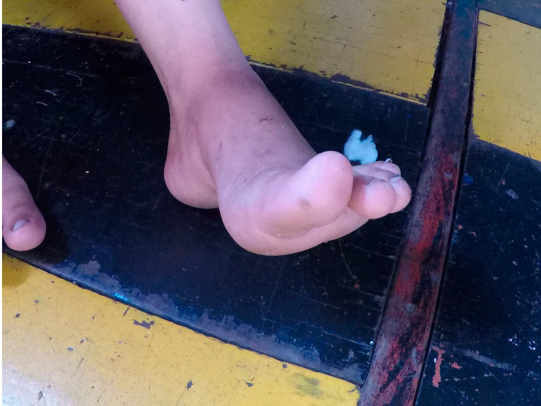
Figure 3. Scar from Desmodus rotundus bite on the thumb of an 11-year-old child. Portel, 2019.

identify risk factors associated with bites by hematophagous bats and immunological status before PrEP of the riverine population in the area. This initiative was crucial in paving the way for future public health efforts to prevent the occurrence of rabies outbreaks in at-risk populations.