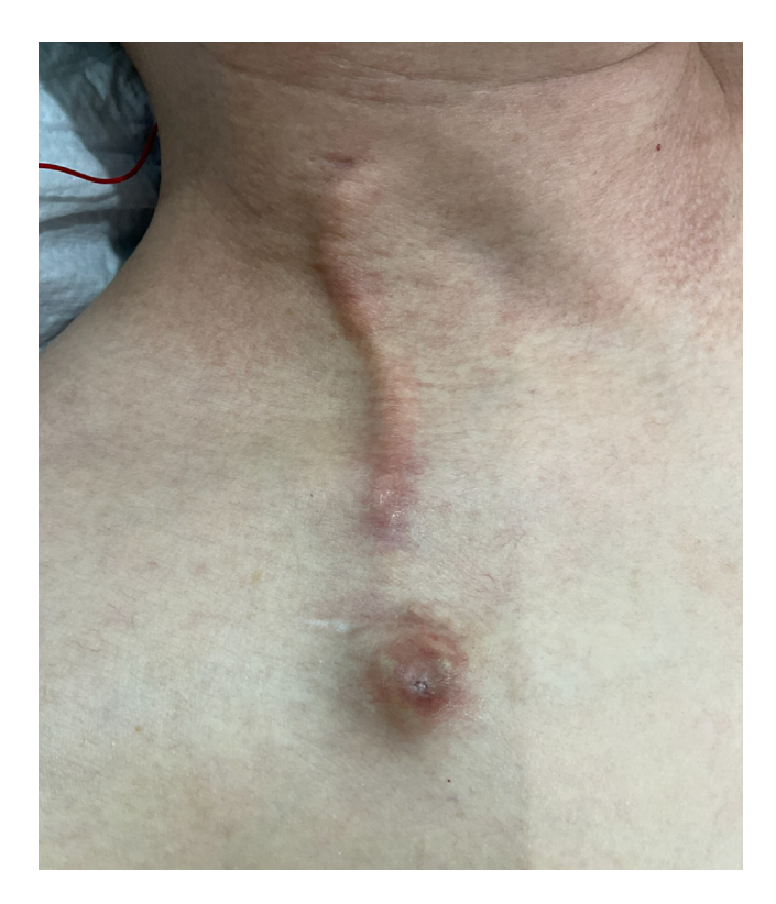
Fig. 1 – Skin changes after 16 cycles of trabectedin infusion through the central venous port (CVP). Skin erythema, swelling, and induration presented along the tunneled catheter of the CVP implanted through the right internal jugular vein.

A 57-year-old man with myxoid liposarcoma presented with skin erythema, swelling, and induration along the tunneled catheter pathway of a CVP (PowerPort; Bard Access Systems, Medicon Inc., Osaka, Japan) implanted through the right internal jugular vein after sixteen cycles of trabected in infusion (Fig. 1). Various blood tests were negative for infection; there-