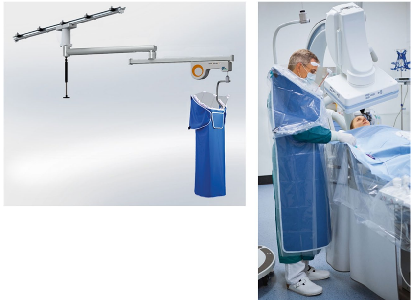
Fig. 4 The ZeroGravity system is comprised of a full body 1.0 mm lead shield suspended from either a ceiling mounted monorail, swing arm, or wheeled floor unit. It is engaged to the operator magnetically via a lightweight vest. An additional 0.5 mm acrylic face shield protects the head, eyes, and throat of the operator while providing direct visualization of the surgical field. All traditional arterial and venous access sites are feasible, as well as full manipulation of the imaging arm. (Reprinted with permission from BIOTRONIK, Inc.)

traditional lead with shields. Further investigation is needed to comment on the prevention of chronic workplace orthopedic injuries when using a suspended lead system compared to conventional vests and aprons.