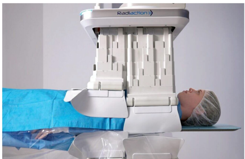
Fig. 7 Radiation Medical aids in reducing C-arm scatter by implanting a “plug and play” accessory to the C-arm, employing a “tunnel” mechanism with flexible fins at the end of the device to reduce C-arm scatter. The device has proximity sensors built into the device to allow for customized fit based on the size and location of each patient. (Reprinted with permission from Radiation Medical)

Radiation Medical is one of the newest concepts to aid in providing comprehensive radiation protection. This device aids in reducing C-arm scatter by implanting a “plug and play” accessory to the C-arm. The accessory (Fig. 7) implements a “tunnel” mechanism with flexible fins at the end of the device to reduce C-arm scatter. The device has proximity sensors built into the device to allow for customized fit based on the size and location of each patient. Conceptionally this product mirrors the 360-degree radiation scatter protection design of the Eggnest XR. This product is one of the newest concepts within the field of radiation protection, and a current small internal study show promising results with an over 80% reduction in radiation exposure among electrophysiology (EP) ablations and cardiovascular implantable electronic device (CIED) implantations [18]. Further advantages are highlighted in Table 1. This product is not currently on the market for approved use at this time.