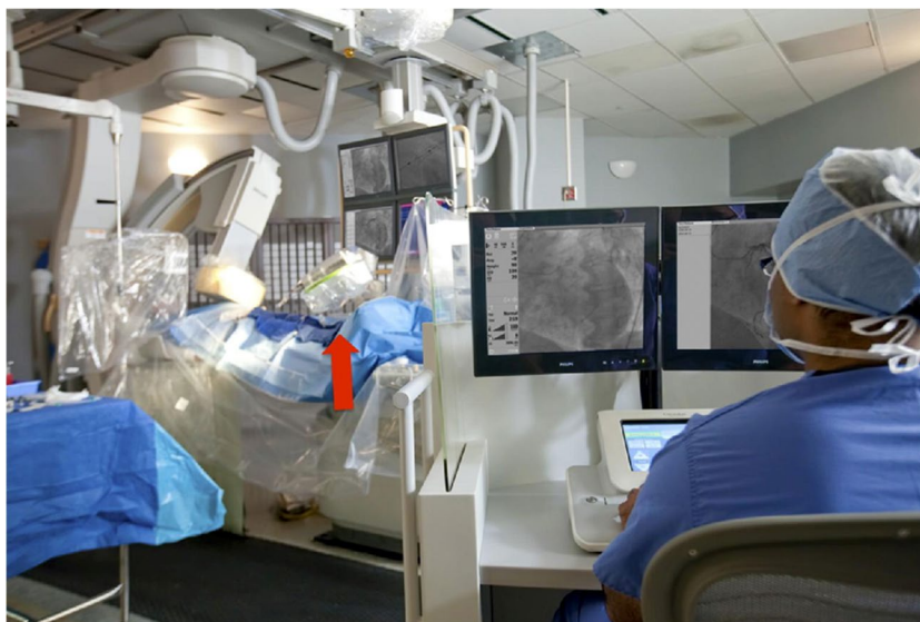
Fig. 6 The Corindus CorPath 200 (indicated by the red arrow) was built to assist with coronary PCI and is comprised of 2 major components: the bedside unit [left part of the image] and the interventional cockpit [right part of the image]. The interventionalist is stationed at the cockpit and remotely performs the PCI using the joystick and touch-screen buttons of the CorPath 200's console. The robotic

cassette imposes axial and rotational forces on the intracoronary devices as it is loaded with interventional devices and is connected to the guide catheters. The CorPath 200 was developed to work with all 0.014-inch guidewires, rapid-exchange coronary angioplasty balloons, and stent delivery systems.