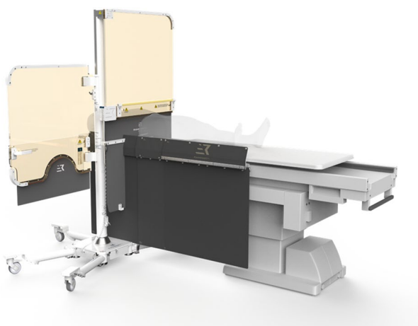
Fig. 3 The RAMPART-IC is an adjustable, motorized, lead-equivalent acrylic panel system. Together with the adjustable shields, the sterile drape system accommodates radial, femoral, and pedal access catheterization.

however overall lower total body radiation for all three positions of operators, including primary (fellow), secondary (attending), and tertiary (technician). [12] A limitation to this system highlighted in Table 1 is that it is battery operated and requires the system to be charged, which can take up to 10 h for a full charge. Fortunately, the system typically requires charging only once a year during regular use, and it also has the option to remain plugged in during use.