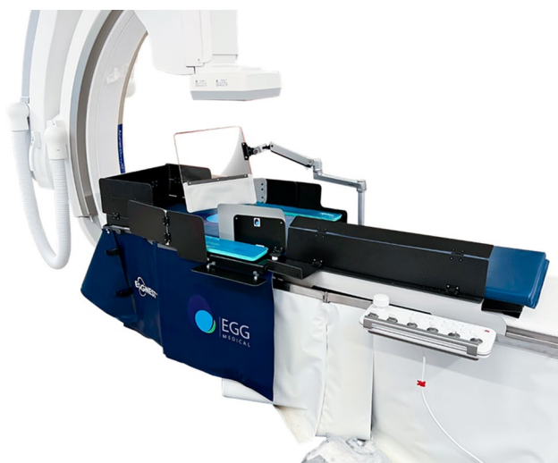
Fig. 1 The EggNest XR system is comprised of a carbon-fiber sled base and mattress, with built in CPR board, as well as shields positioned between the operator and patient to mitigate scatter radiation exposure with 0.5 mm lead-equivalent. (Reprinted with permission from EggNest XR Medical)