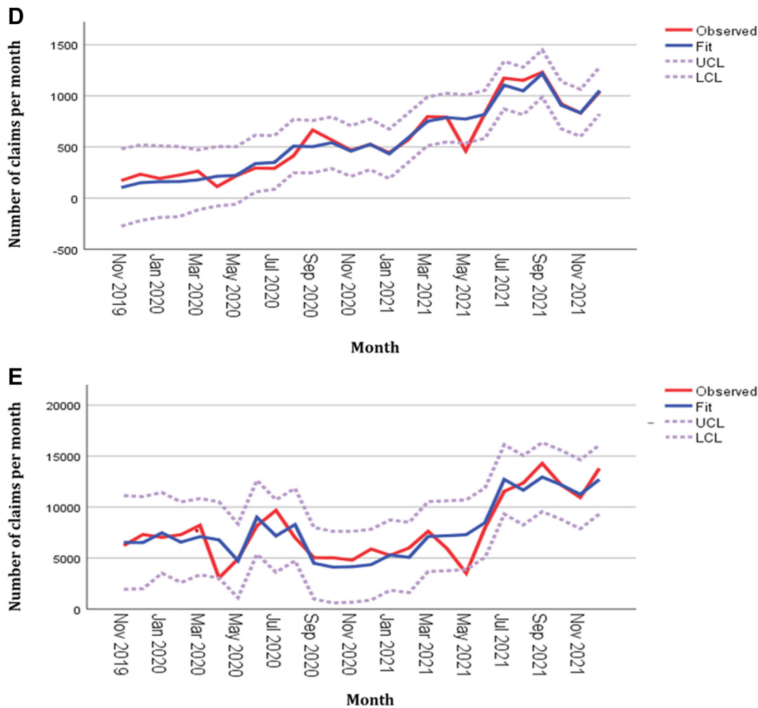
Fig. 1: Continued.

expanding access, unless it is accompanied with an appropriate health benefit package design.