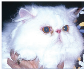
FIG 1 A typical Persian cat. Note the stenotic nares and epiphora. You can't hear the snoring, but it was present and referable to an elongated soft palate. This individual also had polycystic kidney disease. It is by no means the worst example one of the authors (RM) has on file!

is shallow, leading to exophthalmos, the tendency to exposure keratitis and growth of corneal sequestra. 2 The tear film just can’t stretch that far! Their teeth erupt at such bizarre angles that they cannot masticate properly; the resulting propensity for food to accumulate between the teeth leads to accelerated plaque formation and periodontal disease. And if you pull their canine teeth out incorrectly, you will damage that kinky nasolacrimal duct.