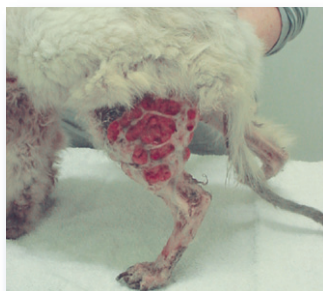
FIG 2 Pseudomycetoma on the hindlimb of a Persian cat with diffuse dermatophytosis due to Microsporium canis . Such cats almost certainly have an inherited immune deficiency affecting either innate or cell-mediated immunity