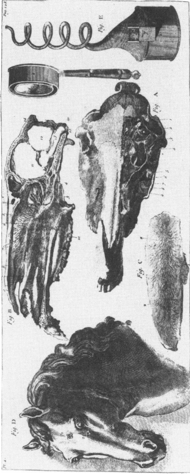
Figure 2. Plate from Ph. E. Lafosse, Guide du maréchal , 1792 (footnote 56). In addition to anatomical details relevant to glanders, Fig. E shows an iron vapoizer recommended by Lafosse for the application of medication through the nostrils.