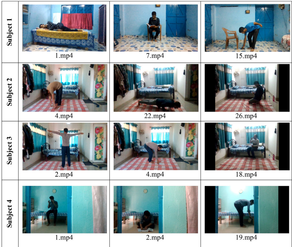
Fig. 2. Some sample frames from the ADL class of the GMDCSA-24 dataset from all four subjects.