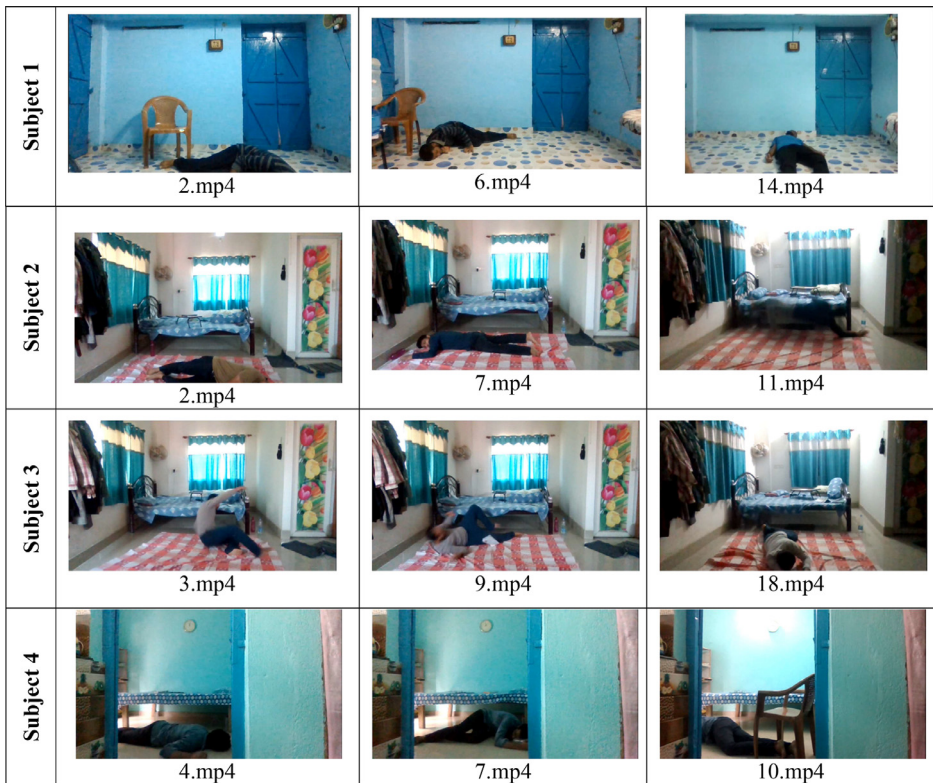
Fig. 3. Some sample frames from the Fall class of the GMDCSA dataset from all four subjects.