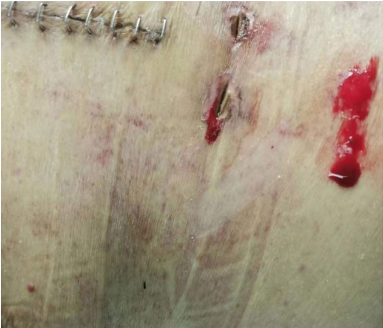
Fig. 1 Locations of the bleeding spots in the patient