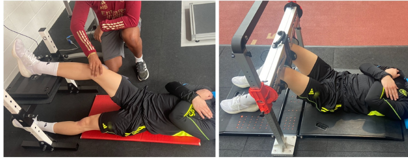
FIGURE 1 Standardisation of participant positioning for isometric posterior chain (left) and isometric hip abduction and adduction (right) strength testing.

remained in contact with the ground, under the plinth, for the duration of each test. For each test, players were instructed to push maximally, down into the force plate for 3 s, whilst keeping their buttocks, hips and head in contact with the ground and their arms fixed across their shoulders. Cueing for all testing was standardised as '3, 2, 1, push, push, push, relax'. All testing was conducted by the same experienced practitioner. Where a measurement error was observed (i.e., the buttocks, hips or head lifted from the ground, the non-testing heel lifted from the floor or the arms lifted away from the shoulders) data were omitted and the player was asked to perform another repetition.