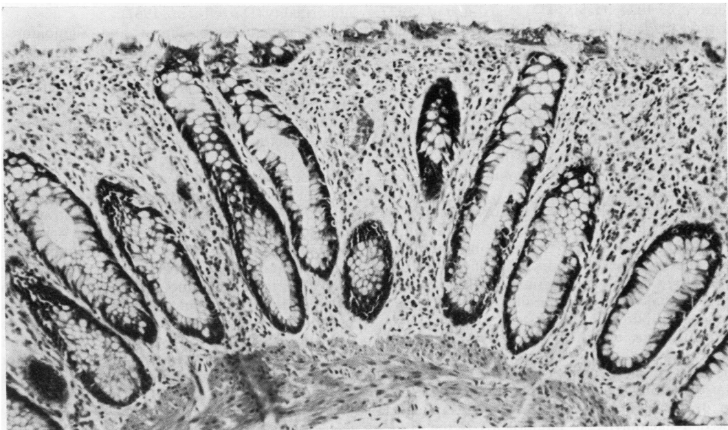
Fig. 2 Histological appearances of the second biopsy specimen.