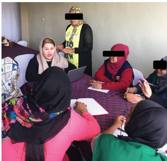
Figure 1. Primary Investigator with the participants of FGD.

Fourteen questions were included in the survey to assess the knowledge of the study participants regarding