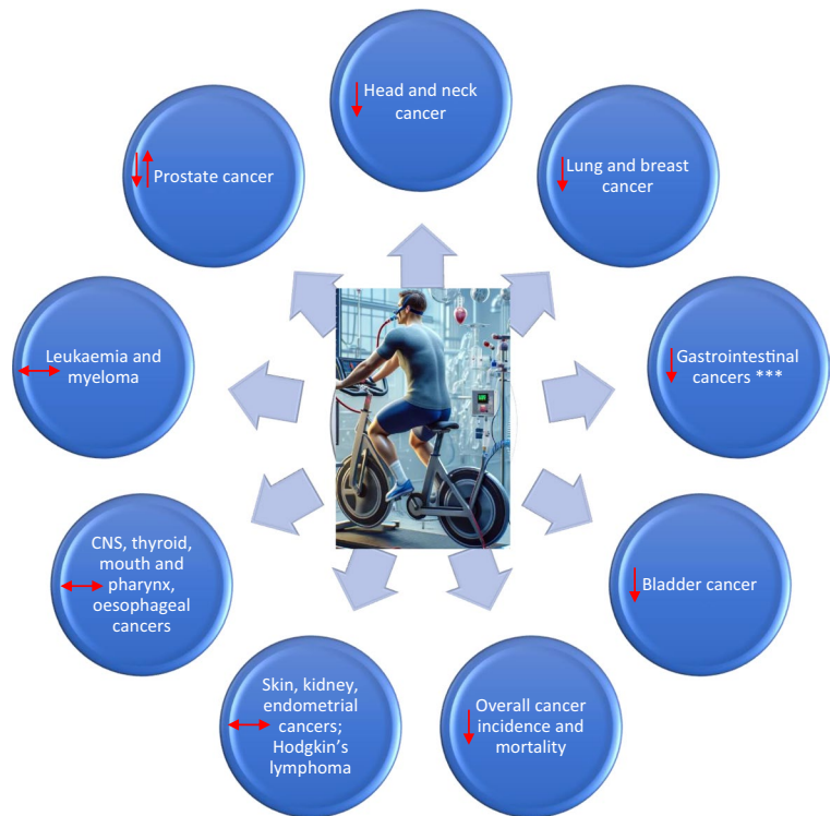
Fig. 1 Cardiorespiratory fitness and cancer outcomes: summary of effects. CNS, central nervous system. ***For gastrointestinal cancers, these include particularly pancreatic and colorectal cancers and potentially stomach and liver, bile duct, and gall bladder cancers

the role of regular PA and/or exercise, which are well established to positively influence CRF levels [98].