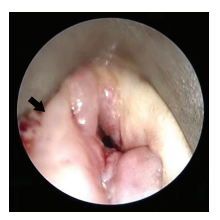
Figure 2. Direct laryngoscopy 14 months after RT; intraoperative finding of a hard fixed mass on the right vocal cord ( arrow ).

determining the best treatment plan which would resolve the recurrent aspiration and dyspnea.