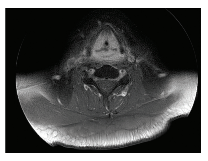
Figure 1. MRI of the larynx 1 month after completing radiotherapy showing diffuse swelling of the glottis.

This case of a dysfunctional irradiated larynx posed a dilemma in diagnosis. Despite multiple negative biopsies, a malignant recurrence could not be completely ruled out. This case also presented a challenge in management, specifically