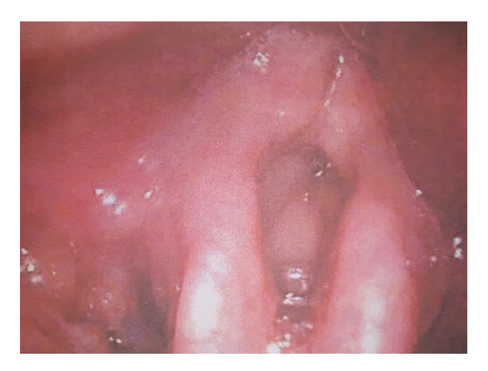
Figure 4. Indirect laryngoscopy 16 months after RT showing diffuse edema.

refused the PET-CT. Risks and benefits of the surgery were explained, which the patient understood and accepted. He opted for surgery, and a total laryngectomy was done. Final histopathology showed no residual tumor as well as chronic inflammation with fibrosis, granulation tissue formation, and necrosis, and the case was signed out as a dysfunctional larynx from post-radiation changes.