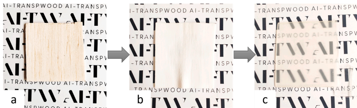
Fig. 2. Images of balsa wood at various stages of the transparent wood production process. Balsa wood (left), delignified balsa wood (centre), and transparent balsa wood with p(HEMA) (right).

At the beginning of the project, the design phase work started with a focused workshop between experimental and computational project partners. [1] Cefic's approach proposes guiding design principles or dimensions to be assessed at the level of product-application combination in a stage-gate-like approach during innovation. However, the specific performance requirements for different applications such as lighting and decorative applications will be addressed later in the project. As results of the workshop, the general (not application specific) requirements and key performance indicators (KPIs) for the performance of TW were summarized in Table 2, and safety and sustainability requirements and KPIs (Activity 1) for TW manufacturing were listed in Table 3. TW is a material suitable for many applications, and the final performance requirements (e.g. mechanical strength, transparency) are mainly determined by the application and its related KPIs. These Tables (2 and 3) will be updated during the project. For instance, the final Table 2 will include information such as the ones provided in Table 1.