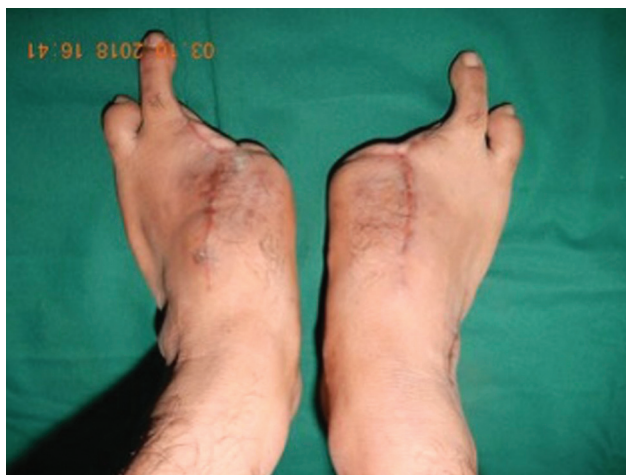
Fig. 6 Donor site deformity of the feet.

The patient was followed up every week initially for the first 2 months and then every month for next 1 year. After a period of 1 year the progress in the function plateaued. 13 At the end of 1 year hand function was evaluated using the Tamai score for activities of daily living 14 (►Fig. 7, ►Videos 1–7).