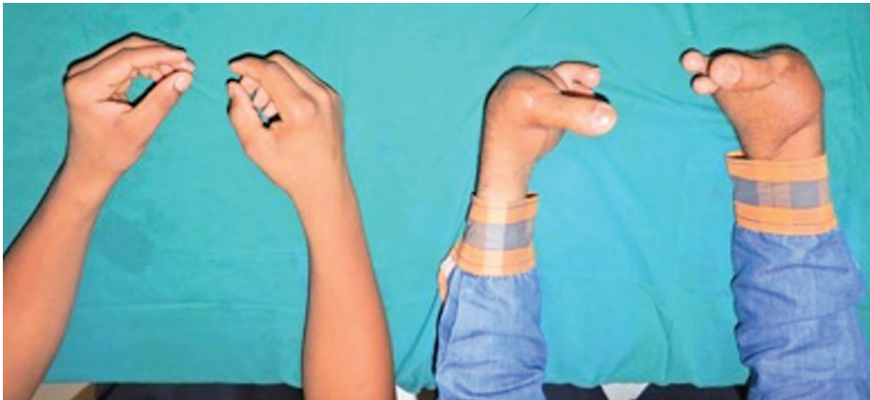
Fig. 3 Reconstructed palmar grip like normal palmar grip.