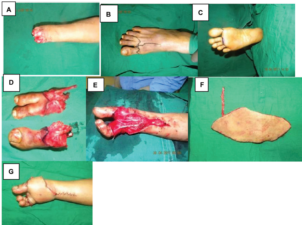
Fig. 2 Right hand reconstruction. (A) Amputation stump. (B) Incisions for toes harvest. (C) Plantar incision. (D) Harvested right great toe and combined 2nd and 3rd toes. (E) Resultant defect after toe transfers. (F) Harvested anterolateral thigh (ALT) skin flap. (G) On table postop result.