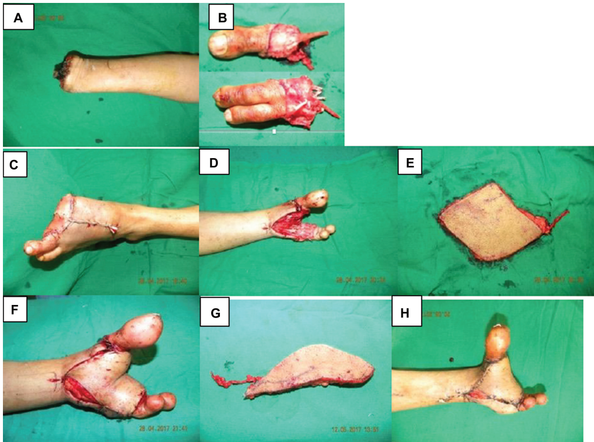
Fig. 4 Left hand reconstruction. (A) Amputation stump. (B) Harvested left great toe and combined 2nd and 3rd toes. (C) Primary closure of the foot defect. (D) Resultant defect after toe transfers. (E) Harvested anterolateral thigh (ALT) skin flap. (F) On table postop result. (G) Harvested thoracodorsal artery perforator (TDAP) flap. (H) TDAP flap inset complete.