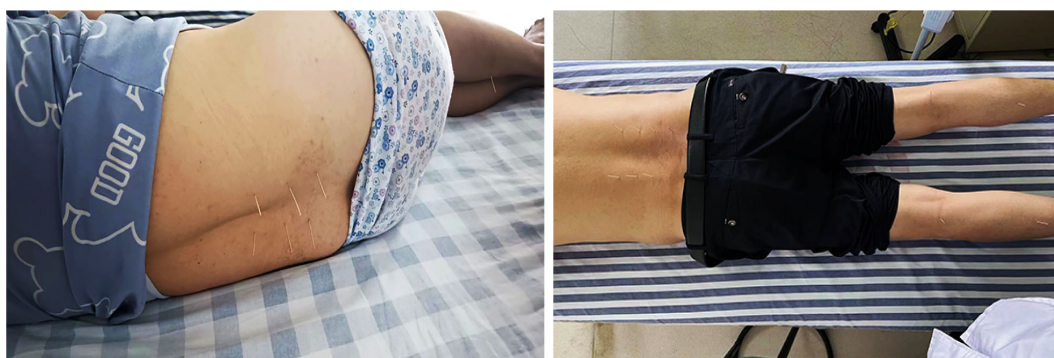
FIGURE 1 Acupuncture treatment diagram for patients with lumbar disc herniation.