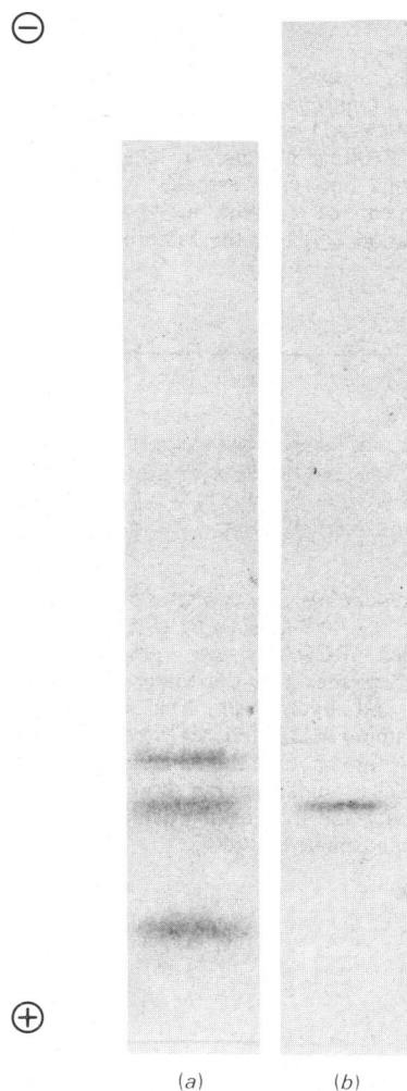
Fig. 1. Sodium dodecyl sulphate/polyacrylamide-gel electrophoresis of ^{32}P -labelled BCOAD

obtained with freeze-thaw extracts and BCOAD prelabelled and purified as described previously (Odessey, 1980b). It therefore appears that endogenous phosphatase activity [which has only been observed in intact mitochondrial preparations (Odessey, 1980a; Parker & Randle, 1980; Hughes & Halestrap, 1981)] is either easily dissociated or degraded during an early stage of purification. Although some of these properties superficially resemble those of the regulatory enzymes of the PDH complex, purified pig heart or ox liver PDH phosphate