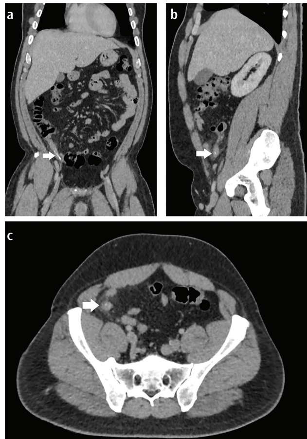
FIG. 1. Coronal (a), sagittal (b), and axial (c) computed tomography planes demonstrating a foreign body in the cecal appendix (white arrow).

Once inside the gastrointestinal tract, these objects typically do not cause adverse outcomes, with complications such as perforation, obstruction, hemorrhage, and fistula documented in < 1% of all cases. 1-5 Perforation occurs more frequently with pointed and sharp objects. 3,4 Once the intestinal wall has been perforated, the foreign body can persist in the intestinal lumen near the damaged area, enter