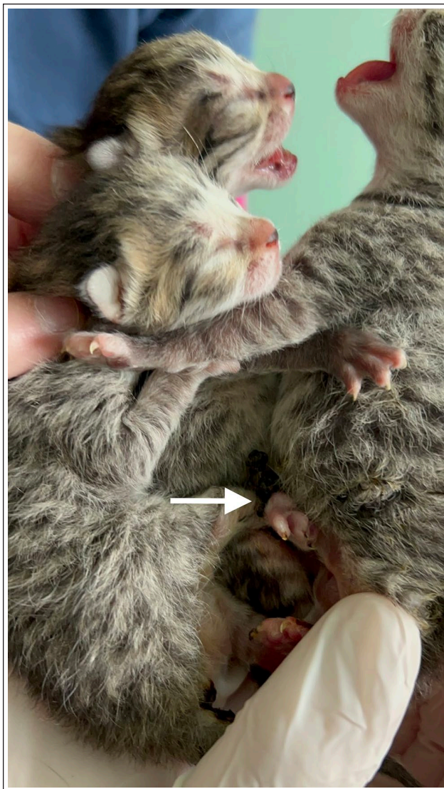
Figure 1 The cords of three kitten entwined with the metatarsus of one kitten (white arrow)

After resection of the umbilical entwinement, conservative treatment involved daily massages and the administration of an alternating hot/cold compress for 7 days. The conservative treatment approach was chosen due to the patient's age. The owner was advised to monitor the kitten's behaviour and appetite. Four days later, the kitten exhibited signs of necrosis of the right metatarsus and was presented with dry gangrene (Figure 3). Seven days after the initial examination, the gangrenous tissue detached, leaving unremarkable skin over the right tarsal joint. Sloughing due to bacterial infection was ruled out based on the patient's overall health status. At the last follow-up examination 6 months later, the kitten was leading an active and normal life.