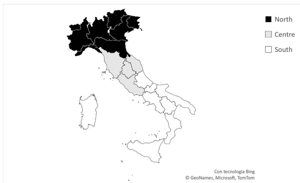
Figure 1. Italian map showing the microregions of Italy divided into macroregions (north, center, and south).

The data for this study (i.e., swimmers' appearances at the annual age-group national championship, birthdates, and place of early development) were publicly available in the public domain and retrieved online from the FIN website ( https://www.federnuoto.it/home/nuoto/graduatorie.html ) (accessed on 1 March 2024). Italy's 20 micro-regions were divided into three macro-regions, as per national indications and policies (i.e., north, center, and south; Figure 1) [31,32], as previously carried out in other studies conducted in the Italian context [26,27]. Swimmers were classified based on birthdate using birth quartiles (i.e., Birth Quarter 1 (BQ1) = January, February, and March; BQ2 = April, May, and June; BQ3 = July, August, and September; BQ4 = October, November, and December) and PED (i.e., northern, central, and southern Italy). The observed birthdate and place of early development distribution of the U15 and the U17 cohorts were calculated and compared to the expected distribution obtained from census statistics [31,32], as well as to the U15 observed distribution to analyze the continuation in the talent model, respectively.