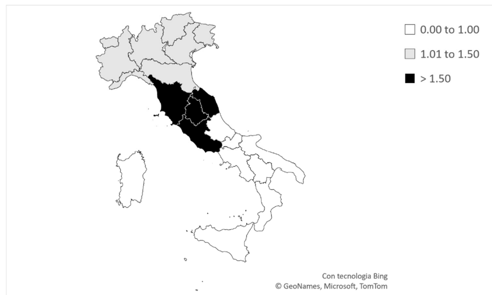
Figure 3. Map of Italy, with microregions separated by lines and colored according to the ORs for competing at the annual U15 Italian male national swimming championship.