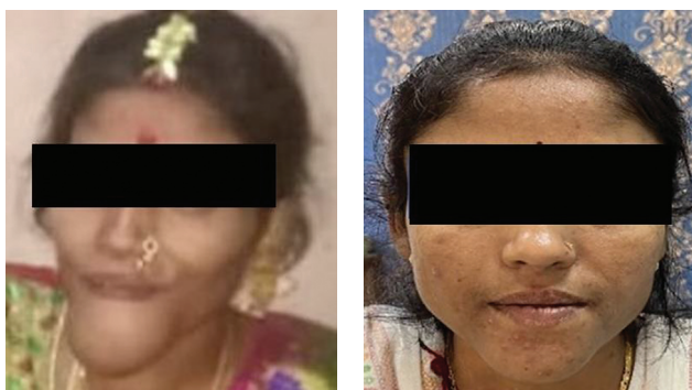
Figure 1. (A) Pre-operative anterior neck and jaw swelling; (B) post-operative resolution of the jaw and neck swelling.

swelling and gradually increasing jaw swelling (Figure 1A), on the third month of gestation. Around the seventh month of gestation, a local dentist evaluated the jaw and neck swelling (Figure 2A). An X-ray revealed a solitary expansile lesion of the central body of the mandible spread across the teeth. It had a distinct sclerotic rim, but no resorption of dental roots was noted. Ultrasonography of the neck revealed a cystic lesion in the right thyroid lobe, 43 x 31 mm, most likely a colloid cyst, and a well-defined mass lesion of 51 x 37 mm of the mandible. There was substantial vascularity in the premental, paramental, and submental regions. Subsequent fine needle aspiration cytology (FNAC) of the mandibular lesion revealed multinucleate giant cells or osteoclastomas. She was advised conservative management until delivery due to risks associated with general anesthesia. 10 She also developed right hip pain, which led to a limping gait. The patient ascribed the pain to the pregnancy; hence, avoided seeking medical advice. She delivered a baby boy at term by lower segment cesarean section (LSCS). The baby's birth weight was 2.2 kg, with an Apgar score of 10/10 and he cried immediately after birth. The cry, tone and activity of the neonate were normal. The neonate was exclusively breastfed successfully and passed stools daily until day 21 of life.