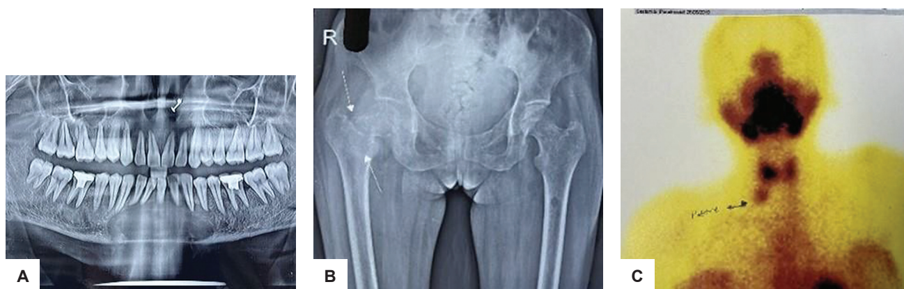
Figure 2. Radiological imaging of the (A) jaw, (B) femur neck fracture and (C) Sestamibi of the right inferior parathyroid adenoma.

On day 20 post-partum, she was further evaluated for worsening right hip pain associated with difficulty walking and limping. A hip radiograph revealed a fracture of the right femur (Figure 2B). She was referred to the endocrine service at a tertiary care facility because of a low-trauma fracture at a young age. This prompted laboratory investigations which showed a high serum total calcium at 3.33 mmol/L (reference 2.10-2.55 mmol/L), alkaline phosphatase 5.73 \mu kat/L (reference 0.63-2.10 \mu kat/L), parathyroid hormone 684 ng/L (reference 15-68 ng/L) and low serum 25-hydroxyvitamin D 22.91 nmol/L (reference 74.88-249.60 ng/mL) (Table 1). Thus, after nearly 8 months since symptom onset, PHPT was diagnosed. A subsequent sesta methoxy isobutyl isonitrile (MIBI) scan revealed a parathyroid adenoma at the lower pole of the right thyroid lobe (Figure 2C). Therefore, surgical intervention was sought, and a right inferior parathyroidectomy was performed in a hospital with limited facilities. Intraoperative monitoring of PTH and intraoperative frozen section facilities to predict the postoperative level of PTH were unavailable at the hospital. However, the patient was unwilling to travel to a larger tertiary care centre due to her child's young age. Histopathological examination also revealed benign parathyroid cystic adenoma and hyperplasia. After surgery, there was a decrease in serum