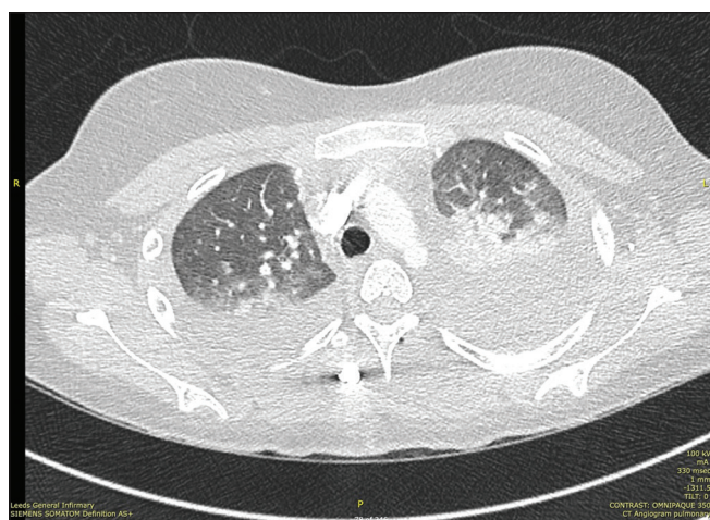
Figure 2: Computed tomography pulmonary angiogram 3-day postprocedure showing left-sided pleural effusion.

204 IU/L, and protein <20 g/L) [Figure 3]. The patient was placed on a low, long-chain triglyceride diet. The drain was later removed, and the patient was discharged without further incident 12 days postprocedure. Six weeks later, she resumed a normal diet, and there were no further adverse events.