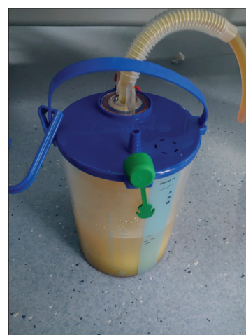
Figure 3: Chyle fluid from left-sided chest drain.

Chylothorax, usually unilateral, accounts for between 2% and 3% of all pleural effusions. Approximately half of cases are due to trauma versus malignancy [Table 2]. [7] Here, the thoracic duct was likely damaged during the pedicle probe or