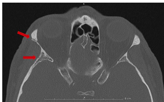
Figure 1. Axial computed tomography scan of the skull in bone window showing fractures. The top red arrow indicates a fracture of the right zygomatic bone, while the bottom red arrow points to a fracture of the right greater wing of the sphenoid bone.