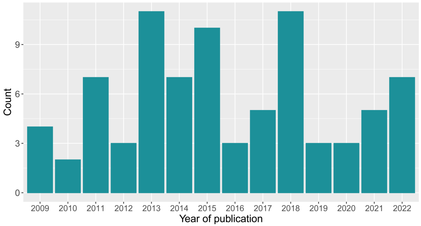
Fig 3. Included studies of EHR-based signal identification by year