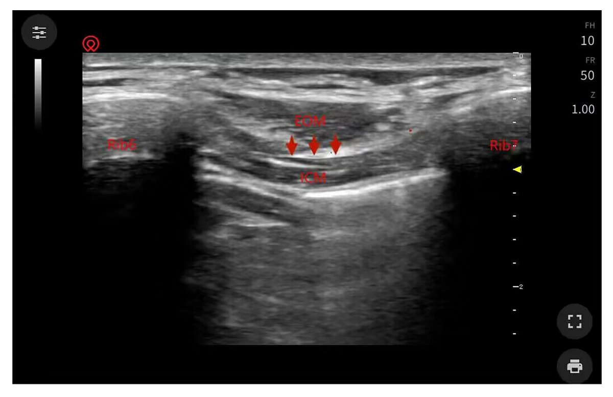
Figure 2. Methods of ultrasound-guided OSTAP block. Note: OSTAP: oblique subcostal transversus abdominis plane.

sents no pain and 10 indicates the worst pain imaginable. Patients were instructed to select a point on the scale that best reflected their pain level, yielding a corresponding VAS score [22]. Pain assessments were conducted at rest and during activity at 1, 6, 12, 24, and 48 hours after surgery. If patients were unable to engage in activity, they were advised to perform VAS assessment after a coughing maneuver.